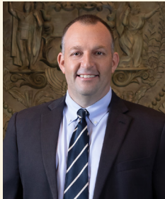
Governor Josh Green, M.D.

As I stated at the start of my Administration in my first address to the Hawai'i State Legislature in January, it is imperative that we come to the table with new ideas, new solutions, and bold action rooted in our shared values. Business-as-usual won't work anymore – there is simply too much at stake to accept the status quo, which is why on July 17, I signed the Emergency Proclamation (EP) on Housing to accelerate relief from the statewide housing crisis.